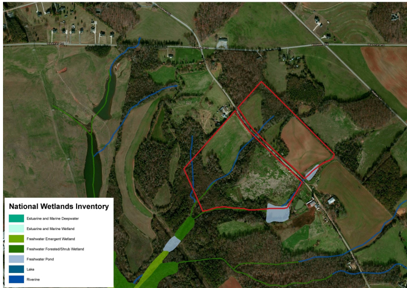
National Wetlands Inventory